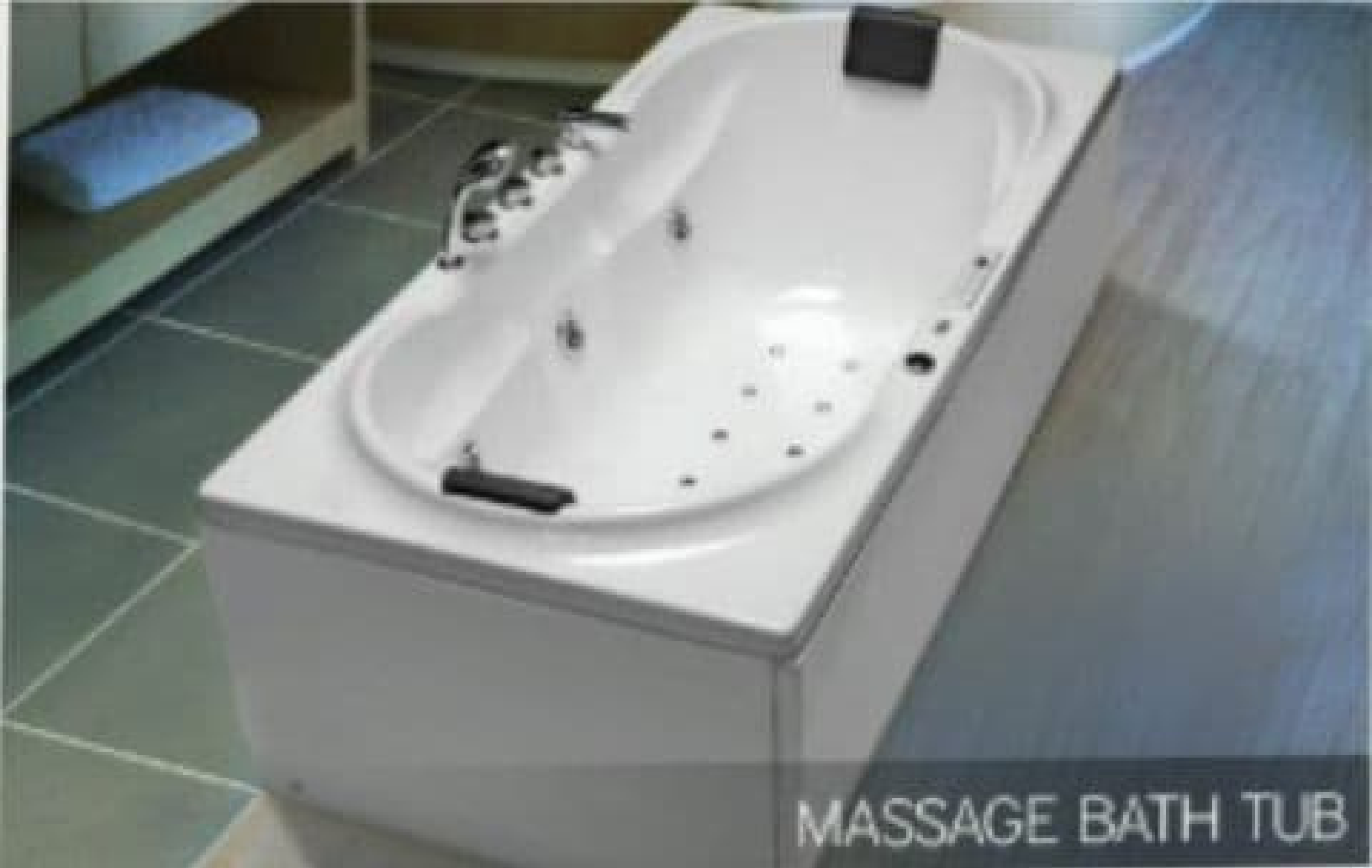
MASSAGE BATH TUB